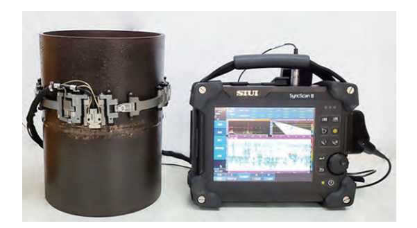
PAUT solution for medium pipe weld