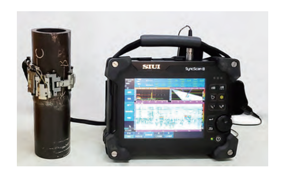
PAUT solution for small pipe weld

Low-profile PA probe is compatible with bracelet type crawler LPS series to cover standard pipes with outside diameters ranging from 20.32-300mm.